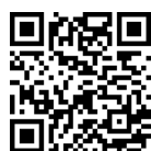
S410 3D demo