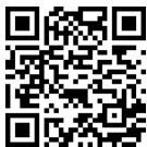
K120 3D demo